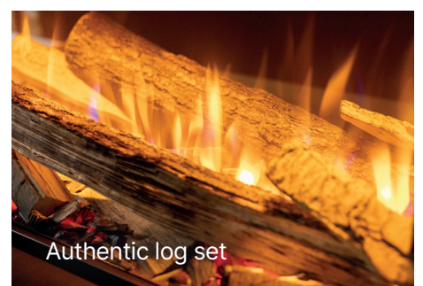
Authentic log set

Anti-reflective glass. Reduces surface reflection from glass