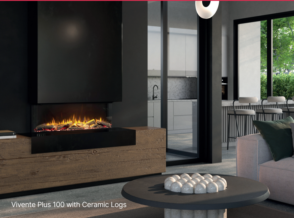
Vivente Plus 100 with Ceramic Logs