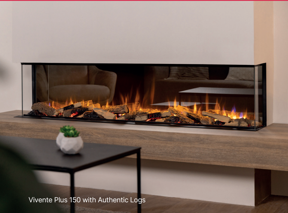
Vivente Plus 150 with Authentic Logs