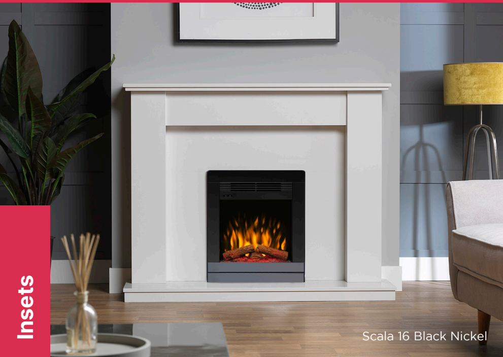
Scala 16 Black Nickel